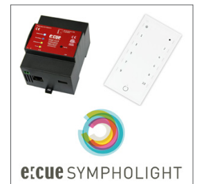
SYMPL Core S, Glass Touch, SYMPHOLight, Actionpad, SymphoTouch App