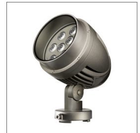
RGBW ProPoint Wall Washer