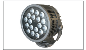
Washer Quattro RGBW