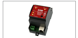
SYMPL-DMX-Node SYMPL-Serial-Node SYMPL-Input-Node SYMPHOLIGHT Software