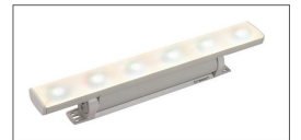
Cove Light AC HO RGBW