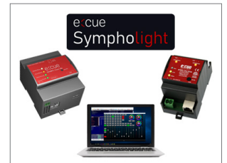
Sympholight, SYMPL Core S, SYMPL dmx Node, ActionPad